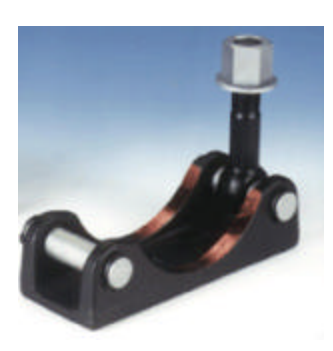
Standard POWTEK M23 Cradle Lug Bracket fit both models. Washer is permanently attached to the Lug Nut.

In addition to the standard 230-460 Volts, the AFC System can be supplied with 48 Volts, which is advisable for use in wet environments where accidental contact with high voltage could be very hazardous to the operator.